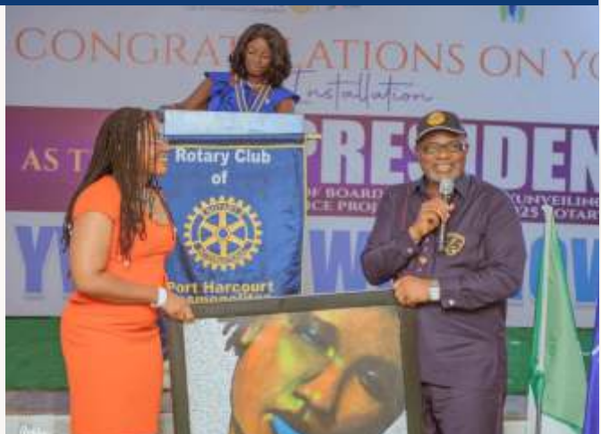
And PE Iwo Grabbed, snatched and Ran with it